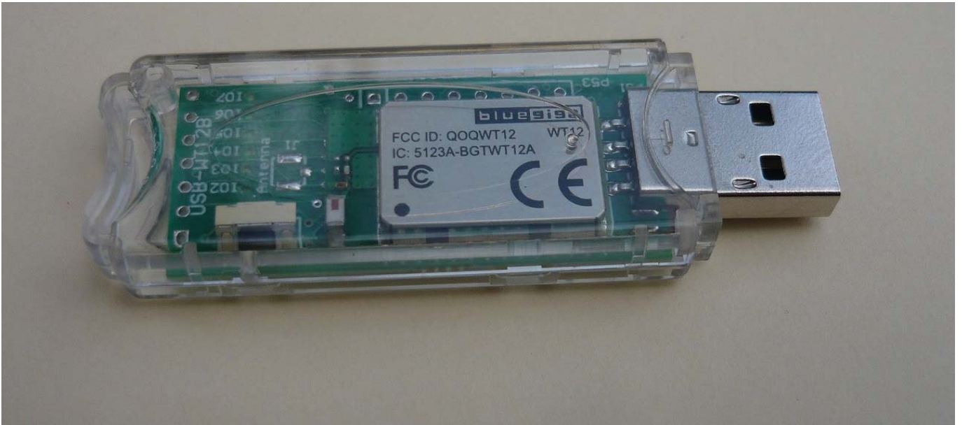
Figure 1 - USB-WT12 device